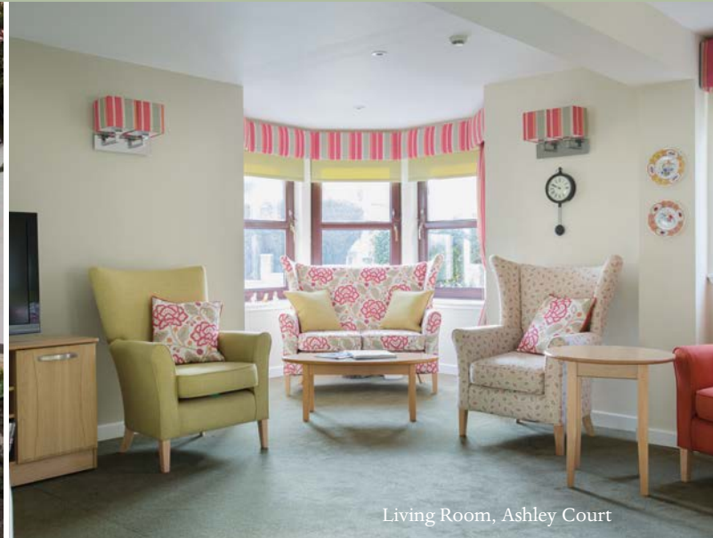
Living Room, Ashley Court