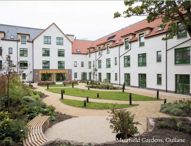
Muirfield Gardens, Gullane

Build a rewarding nursing career at Randolph Hill